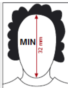
Minimum allowable size