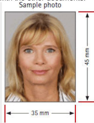
Photo Size Specifications

When you apply for a visa to Europe, the photos are among the vital requirements for the completion of your application. No matter what visa type you apply for, you will always be required to submit two photos, alongside with the other documents.